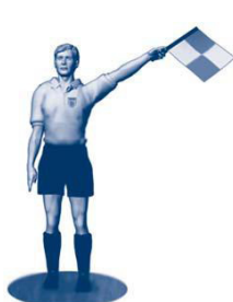
Throw-in for defender