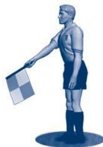
Offside in the near of the field