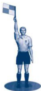
Foul by attacker