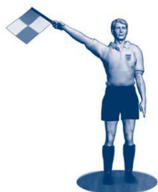
Throw-in for attacker